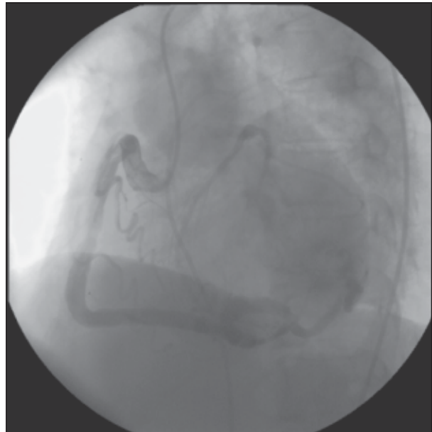
Fig-1: Coronary angiogram showing right coronary artery drain by left coronary artery to pulmonary trunk

A 60 years old man suffering from acute calculus cholecystitis was referred to the cardiologist by a