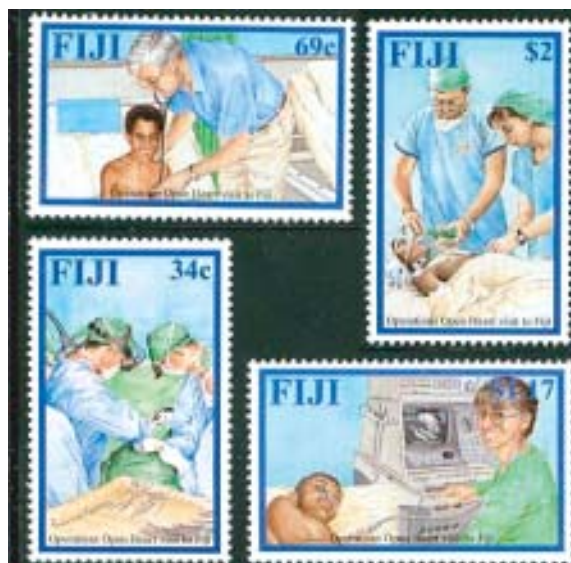
Fig.-13 A: Great Set of 4 MINT Medical Postage Stamps commemorating the visit of a group of doctor and Nurses volunteers visiting Fiji to perform Open Heart Surgery.