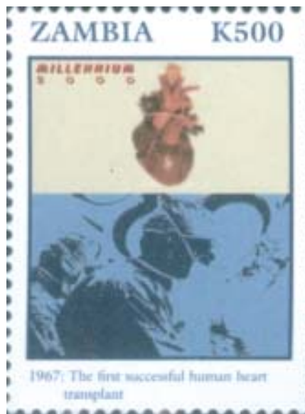
Fig.-12 C: Commemorative stamps regarding cardiac surgery published by Zambia.