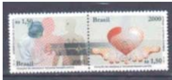
Fig.-12 B: Commemorative stamps regarding cardiac surgery published by Brazil.