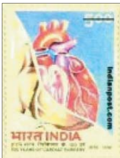
Fig.-2: Indian stamp on 100 years of cardiac surgery.

India had published a commemorative stamp (Fig 2) in 1996 marking the 100 years of Cardiac Surgery. The Rs 5 value stamp was issued on 25th February 1996. The first ever heart surgery was performed by a German surgeon Ludwig Rehn 3 on 7th September 1896. He repaired the stab injury on the Right ventricle of patient. India's not that friendly neighbor China published a stamp on cardiac surgery depicting a surgical team with the patient all portrayed in a landscape fashion (Fig 3). Released in 1975, this Chinese postage stamp portrays open heart surgery with the use of acupuncture for anesthesia.