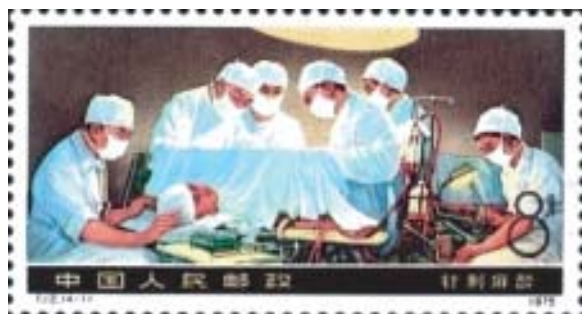
Fig.-3: Chinese stamp on cardiac surgery.

As a highly dedicated member of the British Commonwealth, New Zealand was very much used to printing the busts of its monarchs. But in 1995 coming out of the tradition, they published a series of postal stamps named