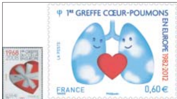
Fig.-11: Two stylish French stamps celebrating 40 years of heart transplantation & 30 years of heart-lung transplantation published in 2008 & 2012 respectively.

event (Fig. 11). The French Post released on 18 June 2012, another stamp (Fig 11) to celebrate the 30th anniversary of the first European heart-lung transplant. The transplant was conducted by Professors Christian Cabrol and Iradj Gandjbakhch at the Hopital La Pitie Salpetriere. Interestingly despite the towering respect for Cabrol in France, the stamps didn't display his image like his South African nemesis.