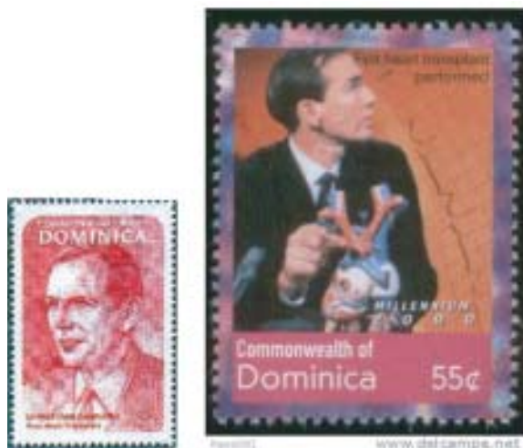
Fig.-7A & B: Christian Barnard, seen on two stamps from Dominica printed on 1997 & 2000.