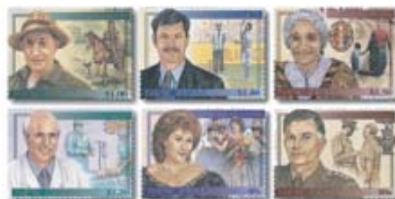
Fig.-4: Stamp set on famous New Zealanders

'Famous New Zealanders' (Fig 4 & 5)) in the field of science, medicine & education. Obviously the all time most famous New Zealander cardiac surgeon Sir Brian Barratt-Boyes was in one of those. Sir Brian Barratt-Boyes, internationally renowned heart surgeon, pioneered new surgical techniques which have earned him the highest respect from peers and patients alike. He is also the co-author of one of the most read textbooks in cardiac surgery. He was knighted at the age of 47 for his contribution to heart surgery. Sir Brian Barratt-Boyes was one of a few New Zealanders honored by being featured on a postage stamp during his lifetime.