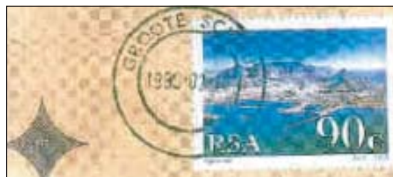
Fig.-6: A postage stamp commemorating the act of Christian Barnard with postmark from his Groote Schuur Hospital, South Africa in 1967.