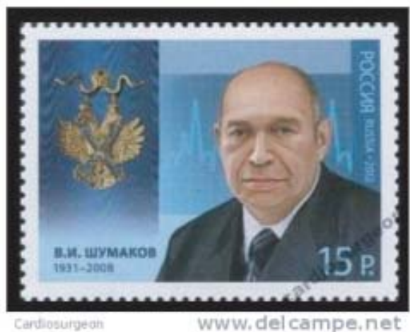
Fig.-12 A: Commemorative stamps regarding cardiac surgery published by Russia.

Several other countries including Russia, Brazil and South African neighbor Zambia also printed commemorative stamps on cardiac surgery (Fig 12 A, B & C). Fiji published a beautiful set of postage stamps commemorating the visit of a team of foreign doctor & nurse volunteers to perform cardiac surgery there (Fig 13).