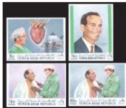
Fig.-10: Bernard on a stamp of Yemen.

Not many cardiac surgeons are so lucky to decorate a postage stamp. One notable exception is Christian Barnard. This renowned South African cardiac surgeon is known all over the world for his legendary first heart transplantation at Groote Schuur hospital, Cape Town. On December 3, 1967, Chris Barnard led the surgical team that performed the first human-to-human heart transplant. The operation captured the public’s imagination as no surgical procedure had before or since, and Barnard soon became an international celebrity 4 . His fame & celebrity status made his face of an immense philatelic value to be portrayed on the stamps of countries beyond the borders of his own. The pioneering act of heart transplantation can now be found on the stamps of countries like, Bhutan, Granada, Dominican Republic, St Helena, Yemen, Spain and Greece besides his own, the Republic of South Africa. Barnard’s rival American surgeon Norman Shumway performed the first successful heart transplantation in the United States 5 . Despite having done all the background research work, he was unfortunate to be second to Barnard, who took away all the name & fame. He is not even displayed in the stamps of his own country.