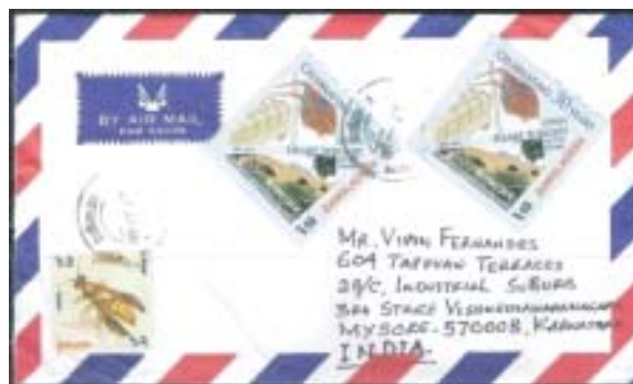
Fig.-1: Bangladeshi stamp celebrating 30 years of cardiac surgery.

Recently a postage stamp has been issued in Bangladesh celebrating the 30 years of cardiac surgery here (Fig 1). The nicely designed commemorative stamp has 10 Taka face value and presents a photograph of the new building of the National Institute of Cardiovascular Diseases (NICVD) building along with the sketches of a heart & a heart lung machine 2 . However the first open heart surgery of Bangladesh actually took place on 18 th September 1981 a few hundred meters away at the then premises of NICVD. This actual site of OT 1 of old NICVD premises was converted to the Principal's office of Begum Khaleda Zia Medical College later renamed as Shahid Suhrawardi Medical College.