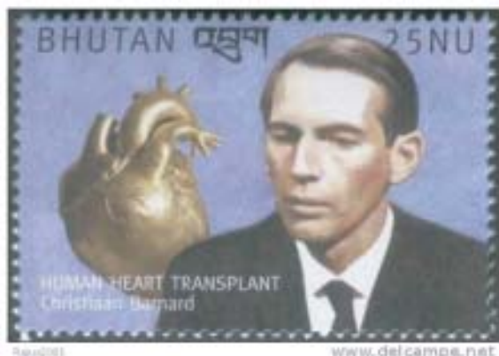
Fig.-8: Bernard on a stamp of Bhutan