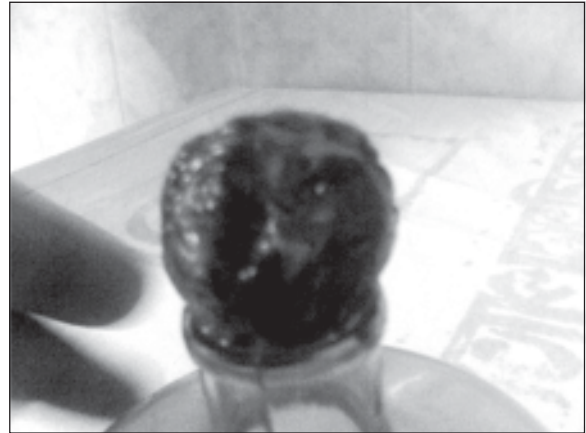
Fig 1: Human face (Ghost face) on an irregular thrombus.

Advice during discharge: Advised to follow precautions for valve replacement and to attend vascular surgery department for limb ischemia and National Institute of Chest Diseases and Hospital(NIDCH) for follow up for TB treatment.