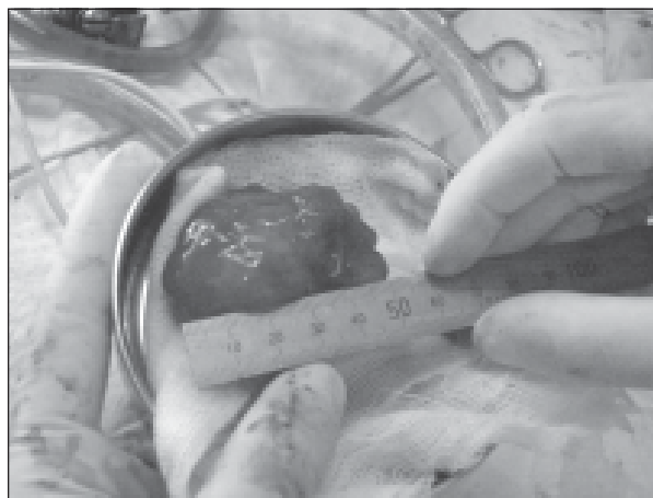
Fig-3: LA myxoma, just after excision