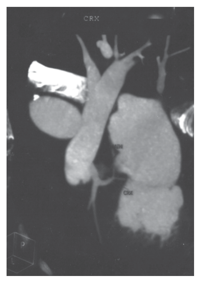
Fig.-3: CT Angiogram showing origin of LCA