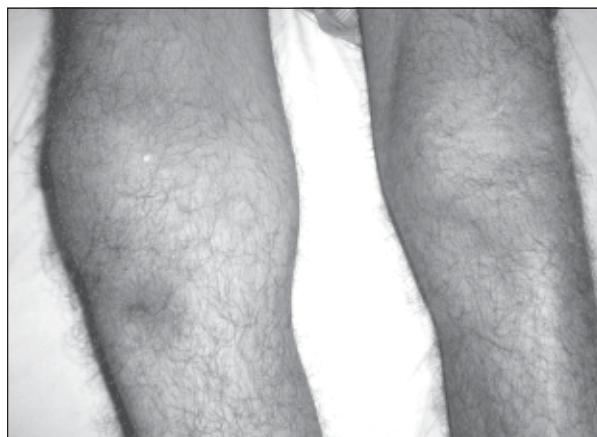
Fig-2: Swollen right knee joint.