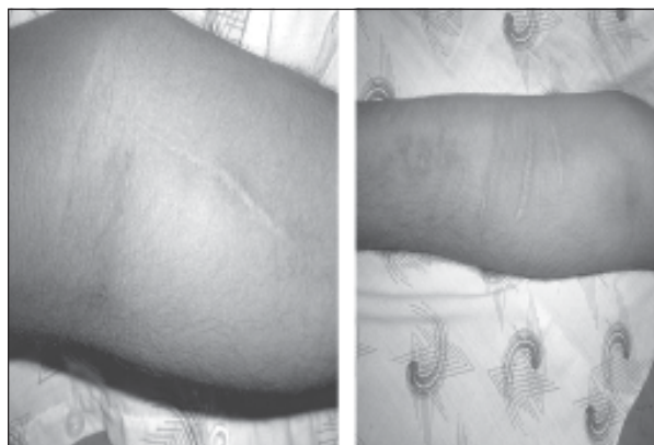
Fig.-1: Scar marks in the forearm at the injection sites.

he was afebrile with good general wellbeing and had moderate tricuspid regurgitation