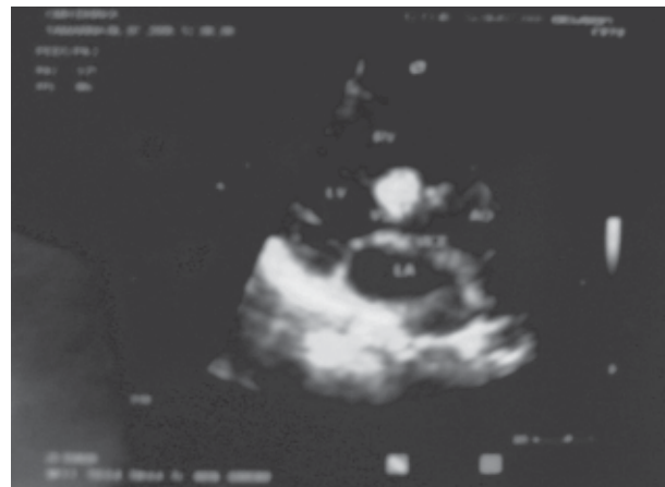
Fig-3: Echo of the patient showing VSD device in position.

measure its distance from aortic valve. A JR-4 catheter was introduced through RFA and VSD was crossed easily with Terumo wire. Terumo wire was exchanged with long exchange wire and it was snared from main pulmonary artery. Exchange wire was taken out of the body through RFV in such a way that a loop was formed with exchange wire all the way from RFA through left and right ventricle and then it came out through RFV. A torque delivery system was then introduced through RFV to aortic root and it was then dropped to LV in such a way that tip of sheath should point towards LV apex. Perimembranous VSD device was then loaded to loader with the help of delivery cable and pusher catheter. Loader was then connected to delivery sheath carefully to avoid air bubbles. Whole system was then forwarded through delivery sheath to LV. LV disc was released under transthoracic and fluoroscopy guide. Whole system was withdrawn carefully and RV disc was released. Patient was discharged from hospital 72 hours after procedure with follow up appointment at 1, 3, 6, 9, 12, 18, 24 months and yearly thereafter for three years.