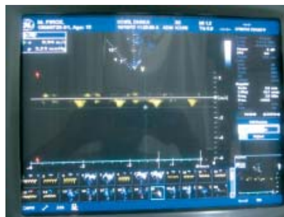
Fig-5: Post operative RVOT gradient was 4 mmHg only.