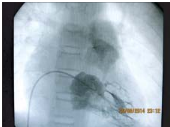
Fig-2: Pre operative Cardiac Catheterization (thick muscular band and jet flow in RVOT).