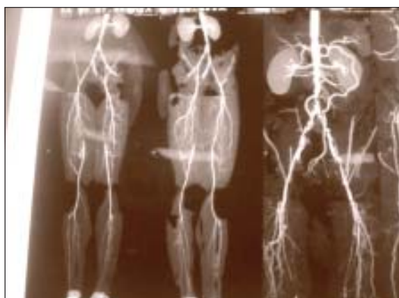
Fig.-1: CT angiogram showing significant stenosis in abdominal aorta and ilateral superficial femoral artery.

treatment of the other, a combined procedure was thought of and discussed with the patient. A CT Angiogram ( Fig-1 ) was performed to assess feasibility of revascularization and also for planning the procedure. The risks and benefits of a combined procedure (as it involved an incision extending from the top of the chest to the symphysis pubis and along the leg to the ankles) was discussed with the patient; which he understood and took 3 weeks to decide. A prolonged recovery time was also discussed and understood.