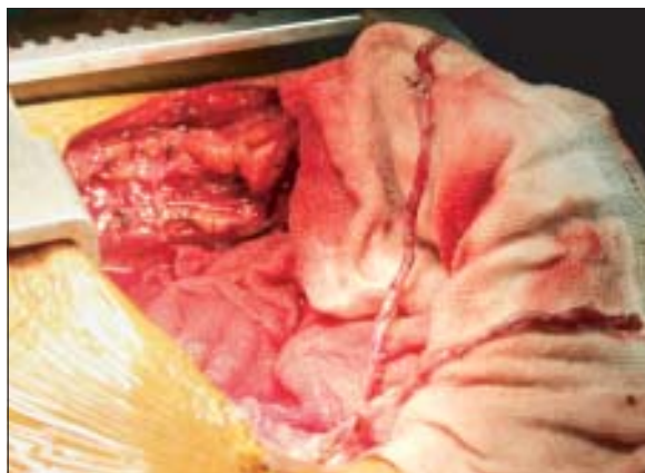
Fig.-2: LIMA-RIMA Y Graft for CABG.

Operation was done on 11.03.14. The Left and Right Internal Mammary Arteries (LIMA & RIMA) were harvested in skeletonized manner. The free RIMA was then anastomosed with the LIMA to make LIMA-RIMA Y (Fig 2). During harvesting of internal mammary arteries, exposure of the Common Femoral arteries, Superficial Femoral arteries, Deep Femoral arteries and Popliteal arteries on both sides was done to assess suitability of grafting.