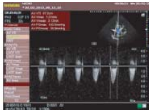
Fig-3: Transthoracic and Transesophageal echocardiography showing severe Aortic stenosis.