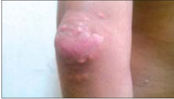
Fig-1: Xanthomatous lesions back of elbows.