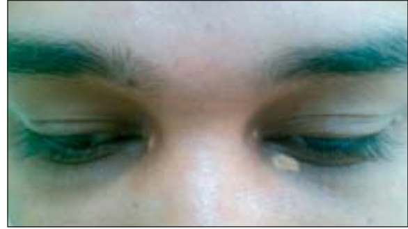
Fig-2: Xanthomatous lesions present over both eyelids.

On palpation of precordium apex was located in left 5 th ICS just medial to midclavicular line and heaving in character. Systolic thrill present over Aortic area. On auscultation, first heart sound were normal, aortic component of second heart sound was soft. There was an ejection systolic murmur of grade 4 in aortic area which radiates to neck, best heard in patient sitting position leaning forward with breath hold after expiration. Other systemic examination revealed no abnormality. Peripheral pulses were palpable.