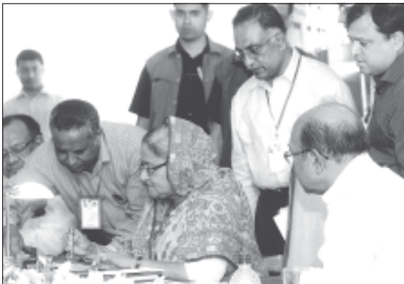
Inauguration of Stamp by Hon’ble Prime Minister Sheikh Hasina

Unique feature of the stamp are: (I) it is rombus shaped-first Bangladeshi stamp of this odd shape (II) It is first Bangladeshi stamp depicting Heart as a theme.