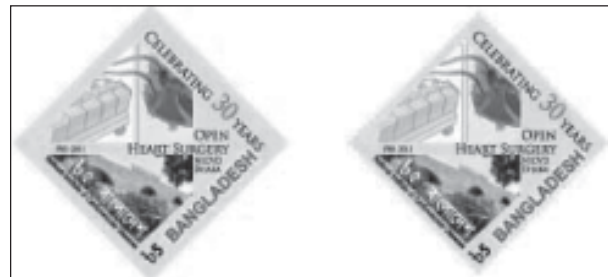
First Rombus shaped Bangladeshi stamp to commemorate 30 th anniversary of open heart surgery in Bangladesh